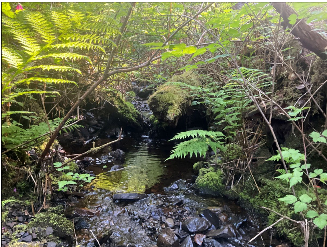
Figure 3.—Channel at waypoint 153, upstream from the road.