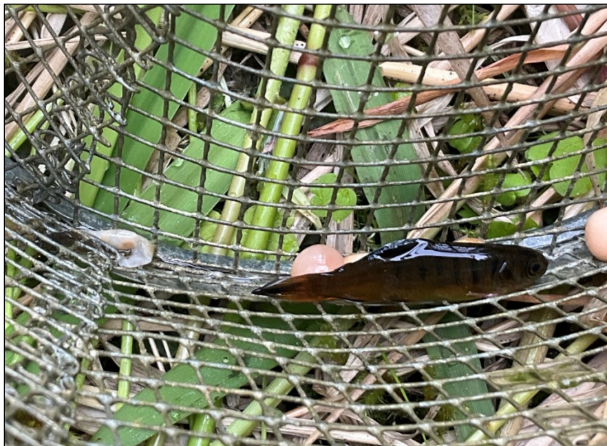
Figure 1.—Juvenile coho salmon captured at waypoint 153.