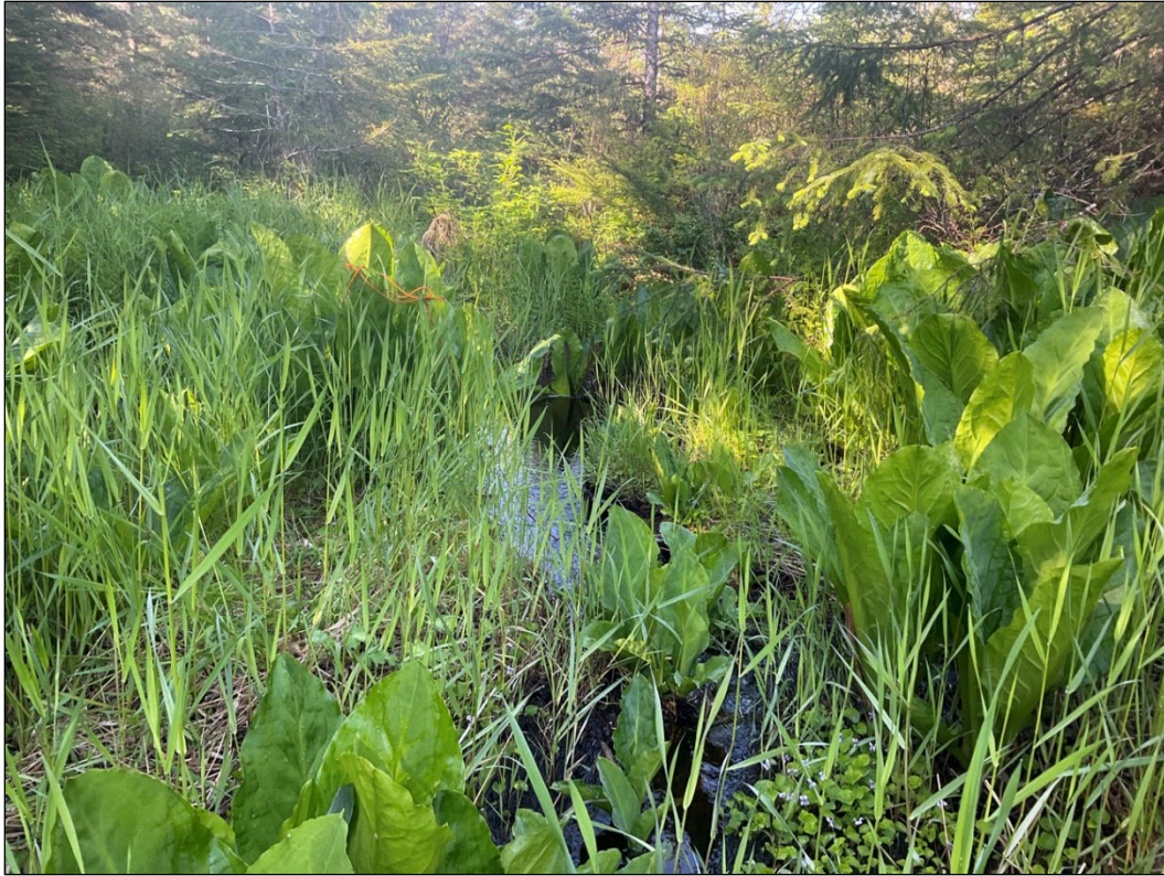
Figure 2.—Channel at waypoint 153, downstream from the road.